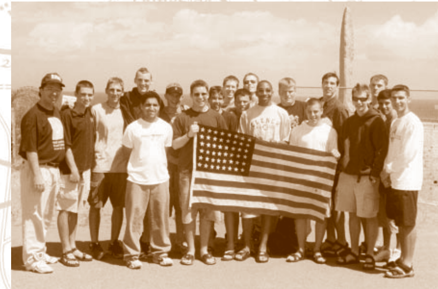
Point du Hoc

I would recommend that all teachers of history make a concerted effort to provide their students with this once in a lifetime opportunity.