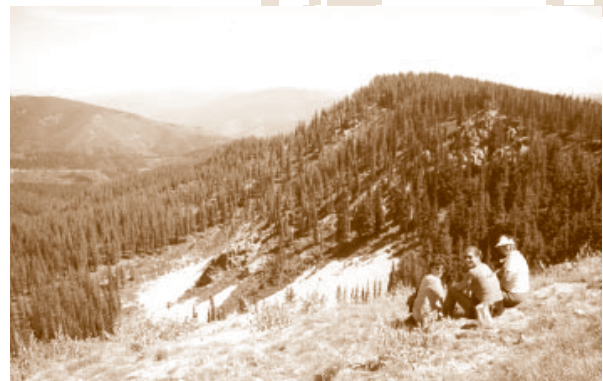
The Luellens at Smoking Place

See page 5 for a brief report from Ron on our newest tour.