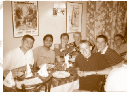
Dining in France