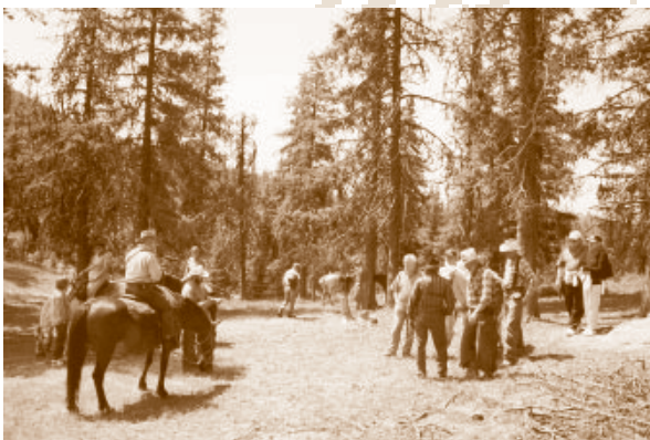
Staging Area For Horseback Tour