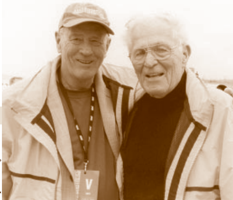
Stephen Ambrose and Dick Winters at the Utah Beach premiere of HBO's Band of Brothers.